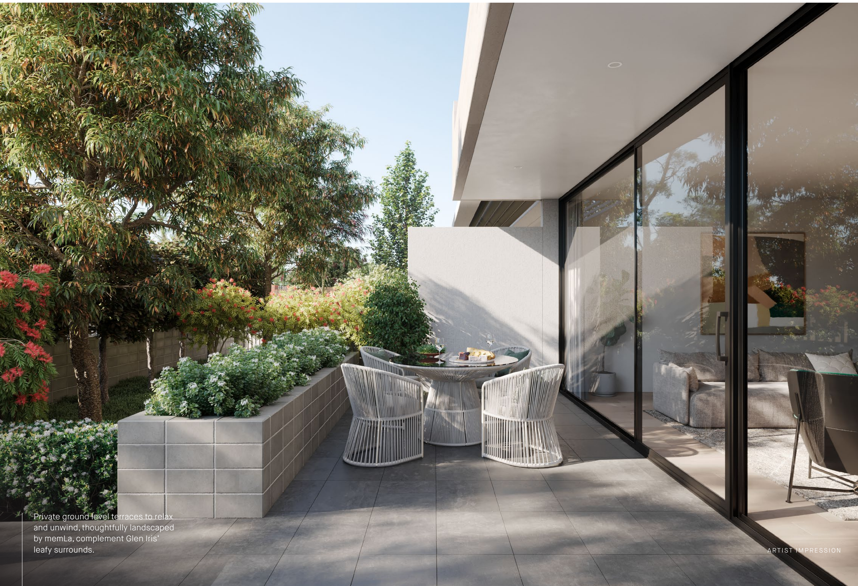
Private ground level terraces to relax and unwind, thoughtfully landscaped by memLa, complement Glen Iris' leafy surrounds.