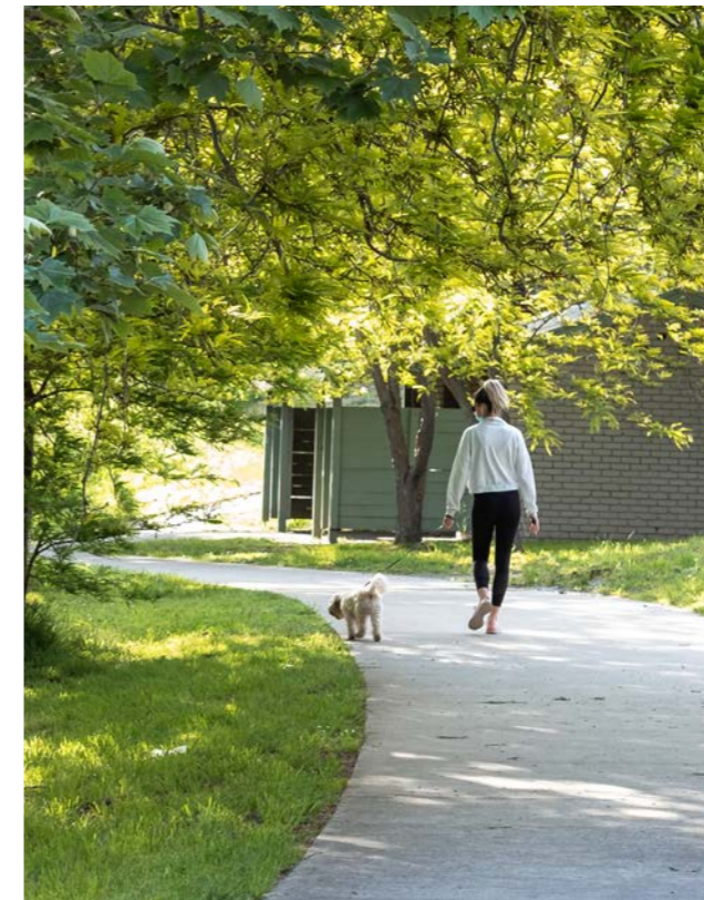
Left — Plenty River Trail Top — Greensborough Plaza Bottom — Kalparrin Gardens