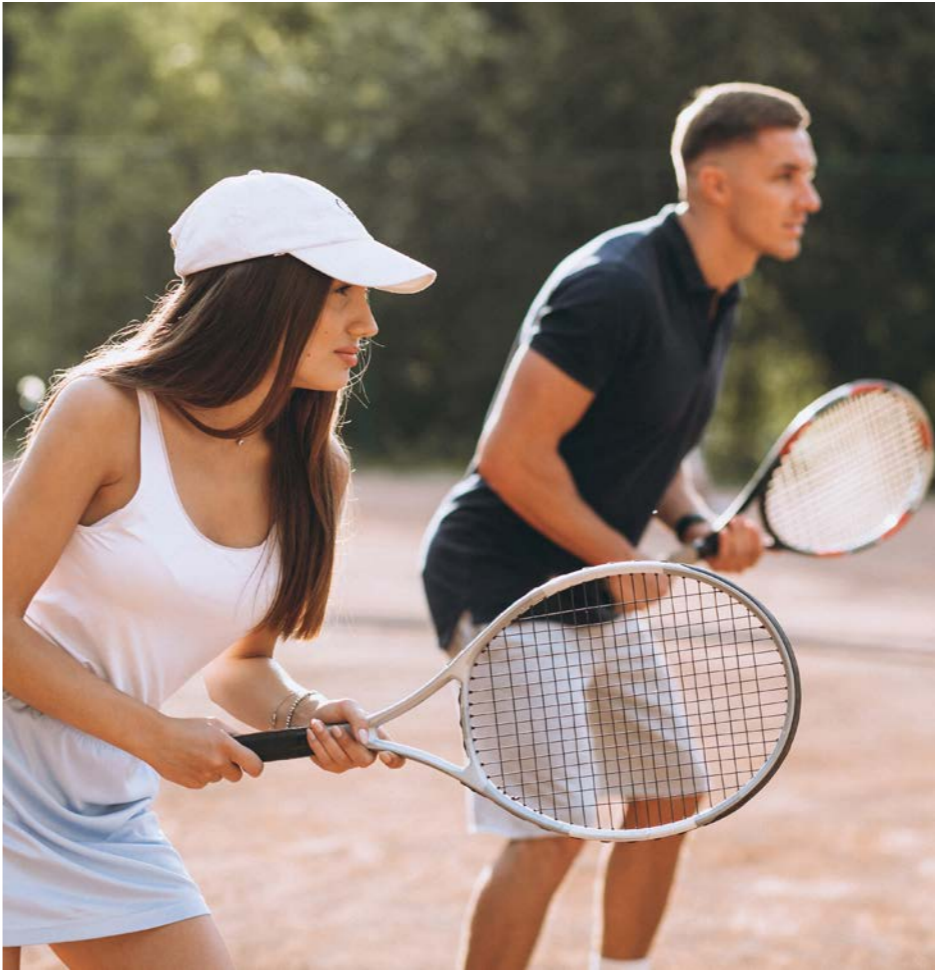
Left — Plenty River Trail Above — Kalparrin Gardens Right — Greensborough Tennis Club