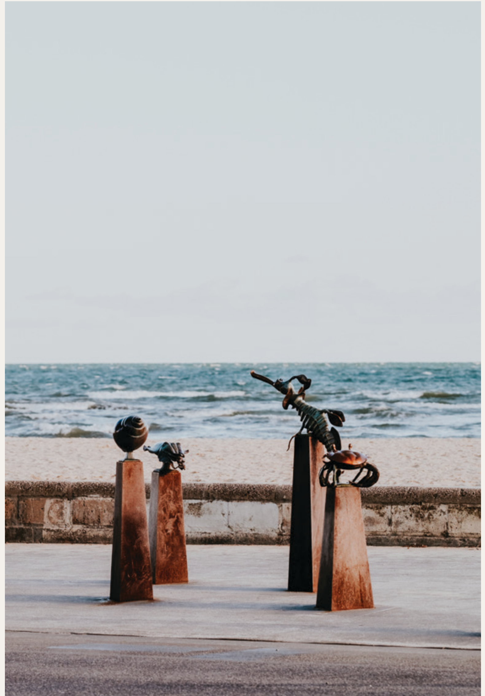
LEFT: ALTONA BEACH | MIDDLE: ALTONA DOG BEACH | RIGHT: ALTONA BEACH SCULPTURES