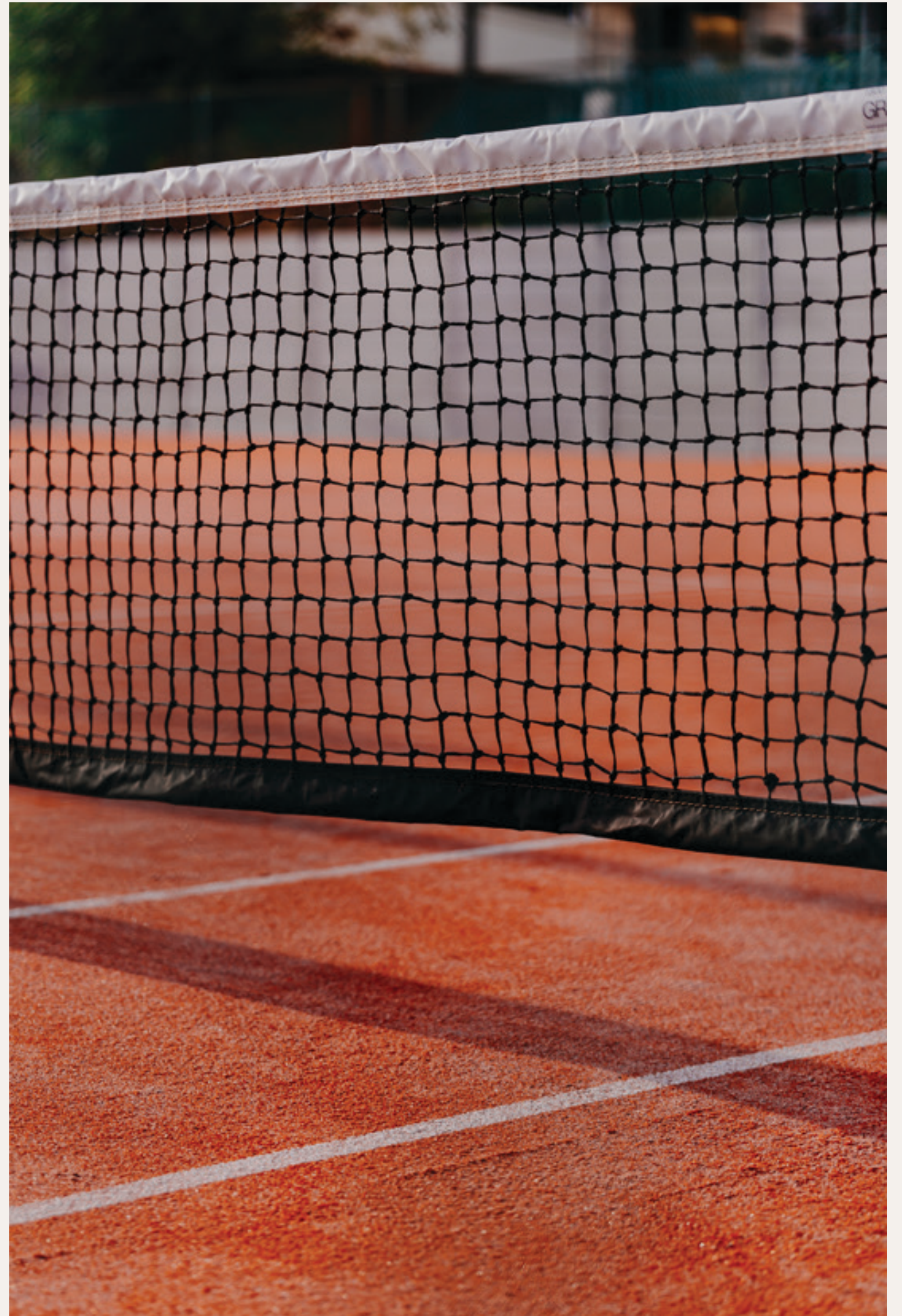
LEFT: ALTONA STATION | MIDDLE: ALTONA GATE | RIGHT: ALTONA TENNIS CLUB