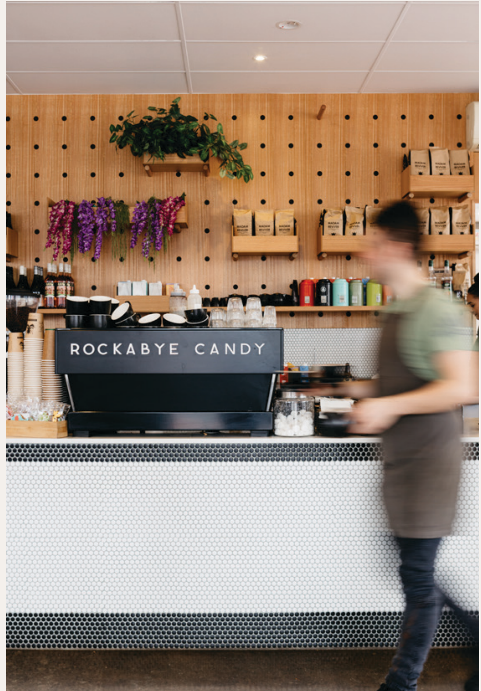
LEFT: ROCKABYE CANDY | MIDDLE: PIER 71 BAR E CUCINA | RIGHT: ROCKABYE CANDY